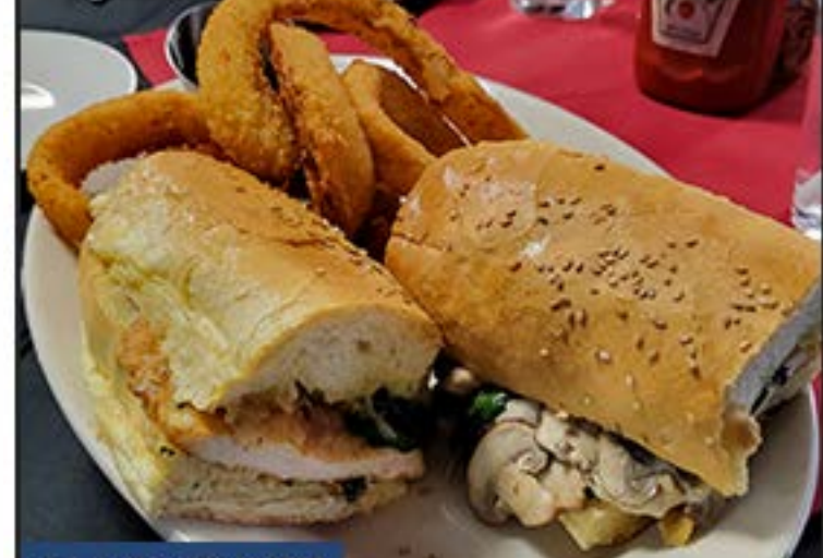
Joey's @ 307