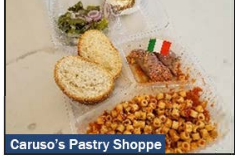
Caruso's Pastry Shoppe