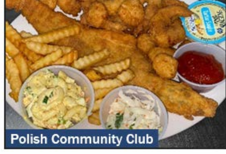
Polish Community Club